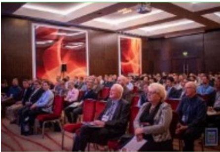
Delegates at the Symposium Alan Auld

140 delegates from 9 countries, Canada, China, France, Italy, Germany, Japan, Spain, UK and the USA, attended the Symposium, the largest contingent being from Japan. Presentations included a Keynote Address and 58 technical papers, 26 by Academics, 15 from Consultants and 17 by Contractors. The topics covered were all aspects of artificial and natural ground freezing involving testing of frozen soils, frozen soil behavior prediction, design of frozen ground temporary works systems to support structures and engineering case histories.