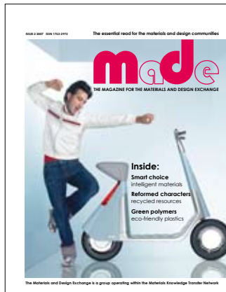
left: Focus – KTN Newsletter middle: one of the new journal titles – International Heat Treatment and Surface Engineering right: MADE Magazine – The Magazine for the Materials and Design Exchange