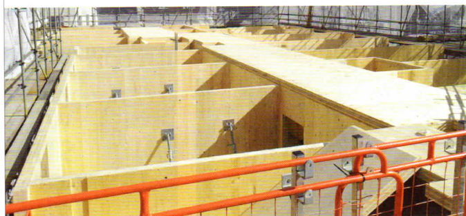
Below: The Kingsgate House CLT development in London

Further afield, the University of British Columbia, Canada has constructed the world's tallest timber structure, the 18-storey Brock Commons student residence, with 17 storeys of CLT floors supported on glulam timber columns. The sky is truly the limit for CLT but in the UK it is the regeneration of housing stock where CLT will pay dividends in the near future. ■